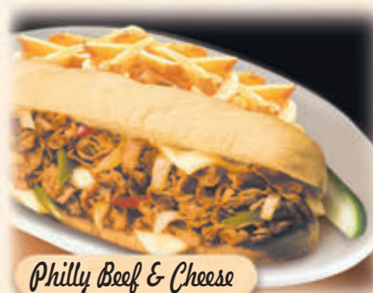
Philly Beef & Cheese