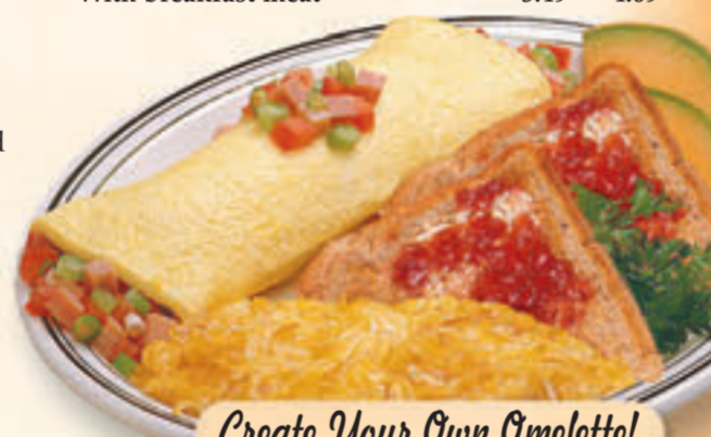
Create Your Own Omelette!