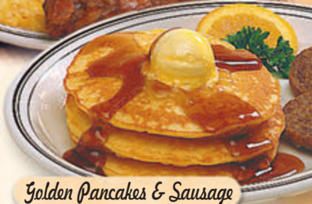
Golden Pancakes & Sausage