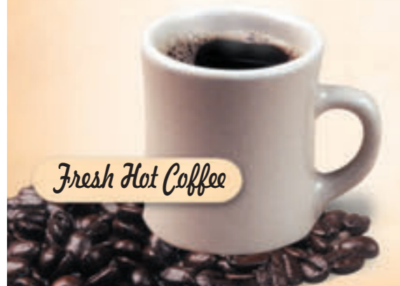
Fresh Hot Coffee

Served with onions, tomatoes and our cool, creamy homemade tzatziki sauce - 5.99