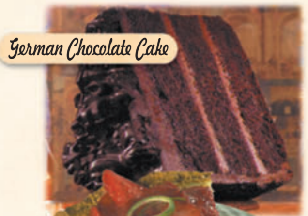
German Chocolate Cake