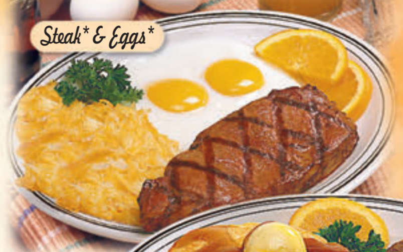
Steak* & Eggs*

*Cooked to order. Consuming raw or under-cooked meats, poultry, seafood, shellfish or eggs may increase your risk of foodborne illness.