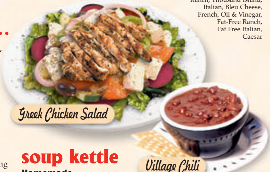
Greek Chicken Salad

Four golden strips of breaded chicken breast, served with your choice of dipping sauce - 4.99